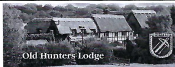
Old Hunters Lodge

Gary Brown – 01582 261076 / 07921 529504