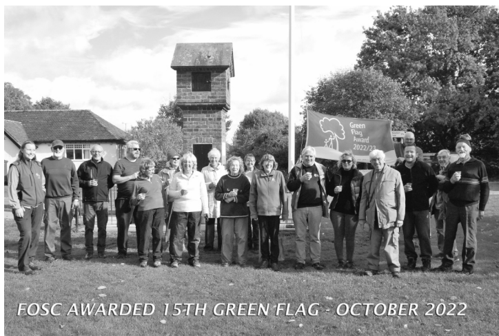
FOSC AWARDED 15TH GREEN FLAG - OCTOBER 2022

Celebrating winning their 15th consecutive Green Flag.